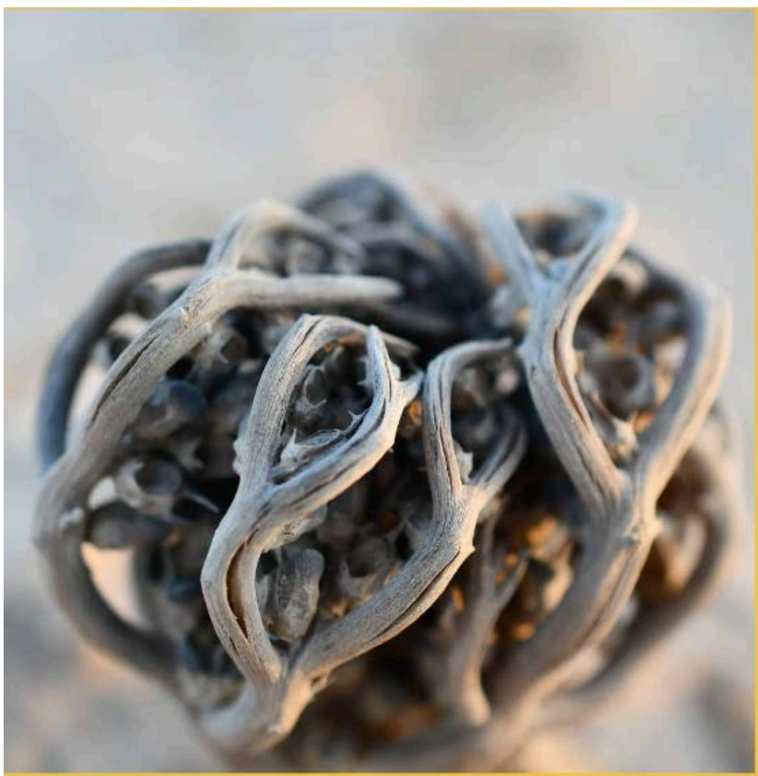
Anastatica (Maryam's flower)